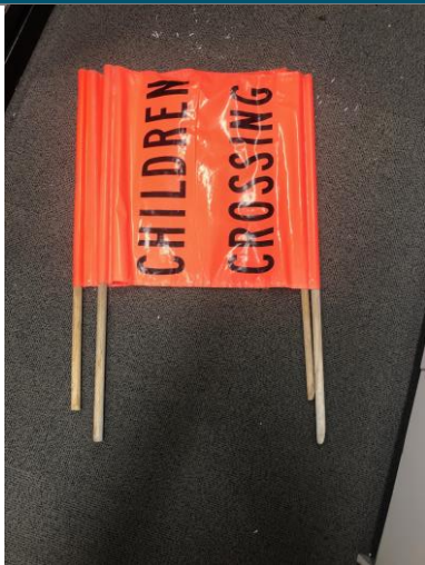
Figure One: Crossing flags.