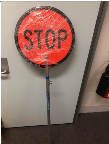
Figure Two: Stop sign/pole/lollipop

Key Environmental considerations: Outdoor environment with exposure to full season conditions.