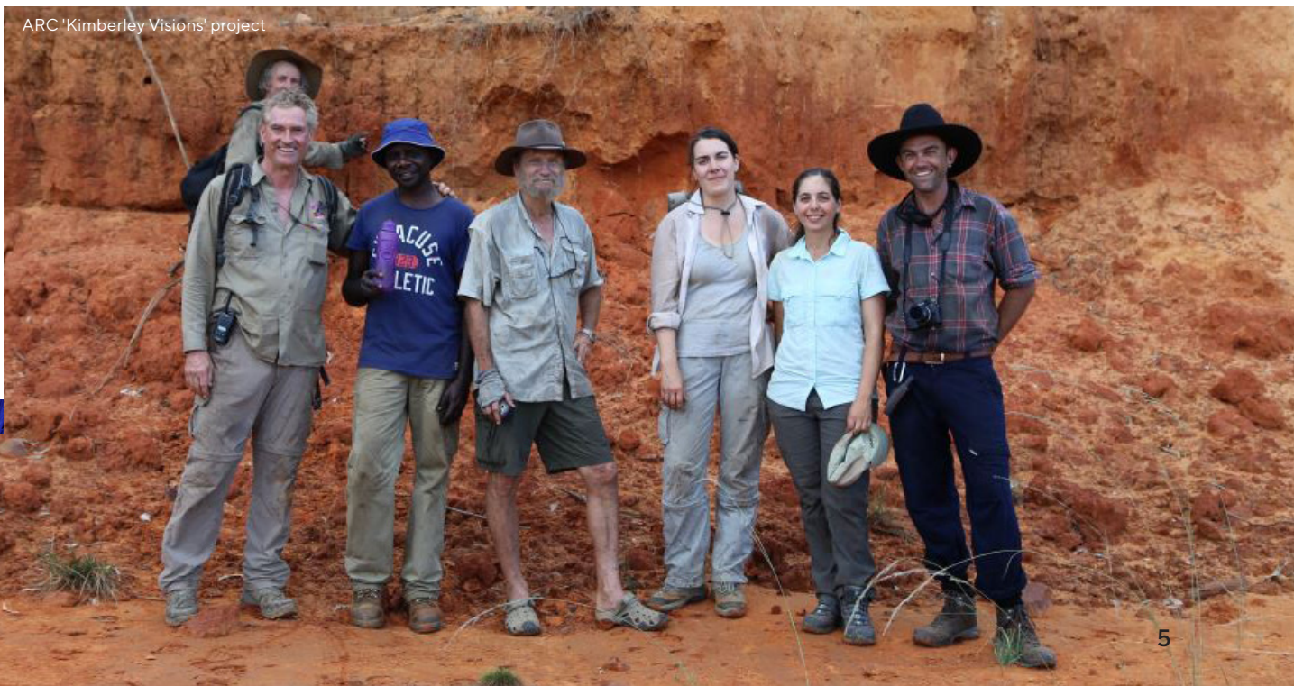
ARC 'Kimberley Visions' project