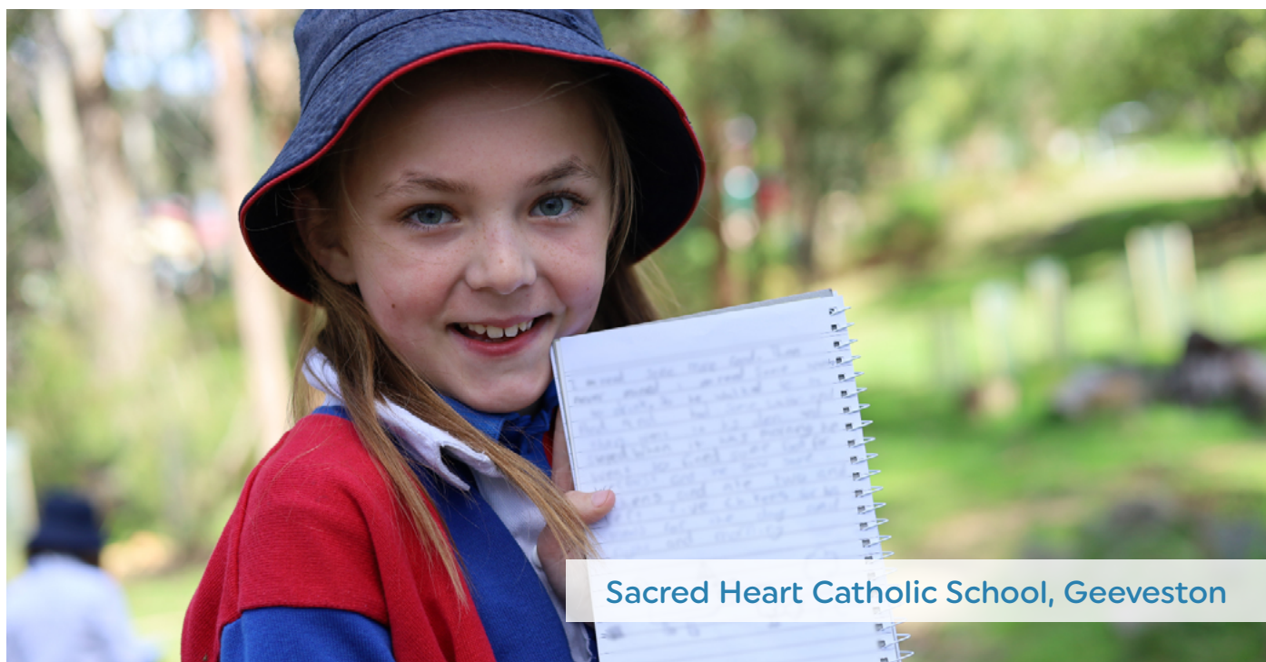
Sacred Heart Catholic School, Geeveston

For further information access the Catholic Education Tasmania website .