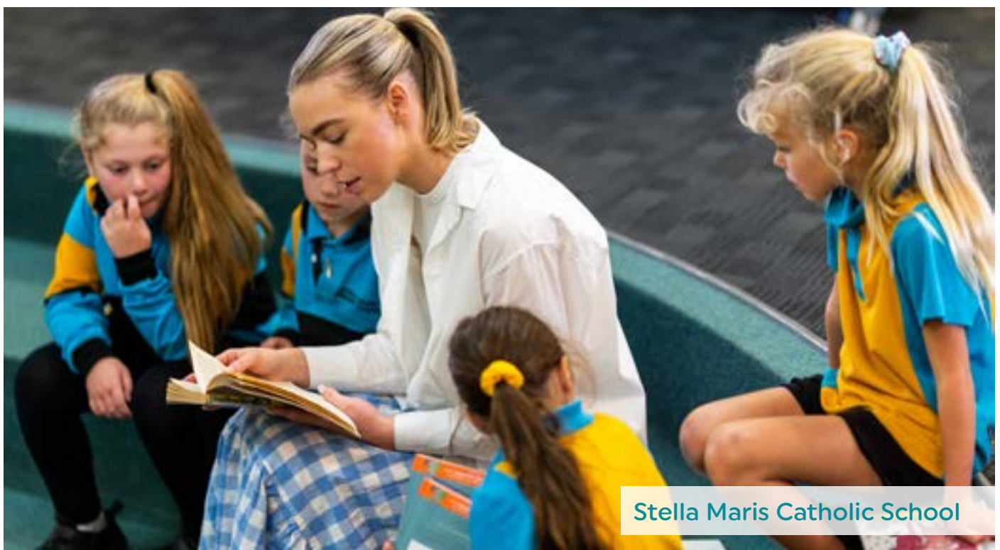
Stella Maris Catholic School

For further information access the Catholic Education Tasmania website .