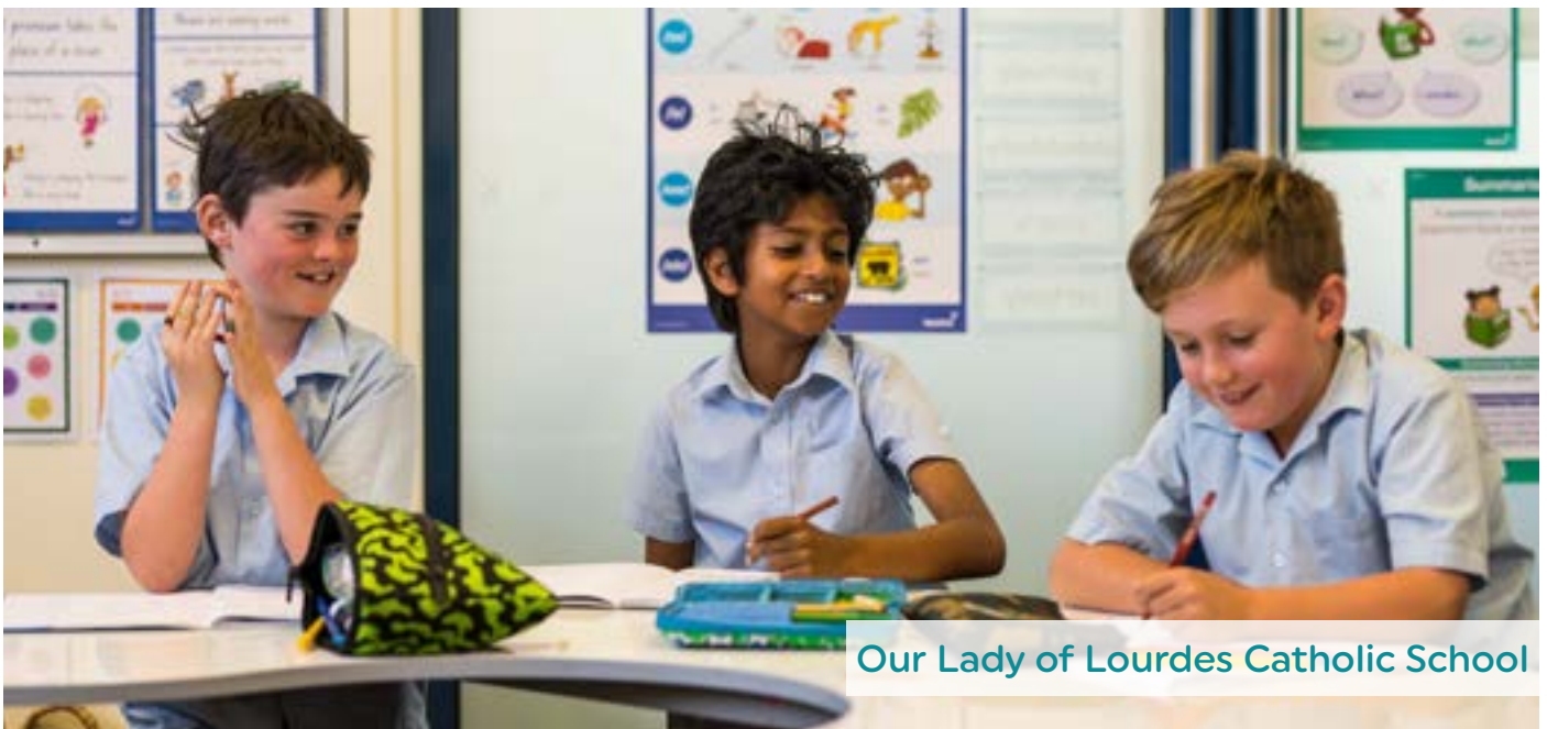
Our Lady of Lourdes Catholic School

The Catholic school exists as part of the evangelising mission of the Church. The Catholic school should be available to all families who desire a Catholic education for their children.