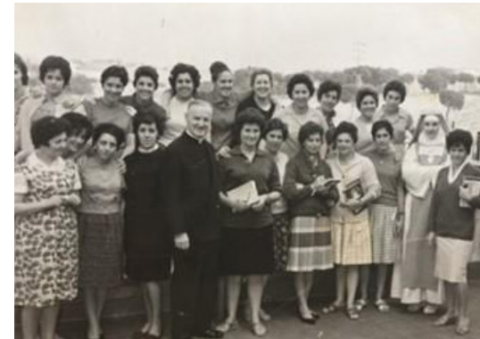
Cannes World Film Festival Award-winning film "The Bride Flights"