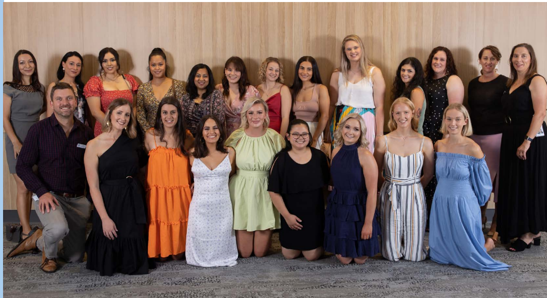
Calvary Adelaide Hospital 2020 GNTP cohort at their graduation. January 2021